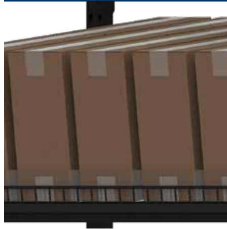
CLEAR FRONT RAIL