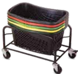
Black tubular hand basket stand with casters Part No. BSKSTANDMOB.BK

We offer two different stand options that fit the GT26. Both stand options safely hold up to 15 baskets.