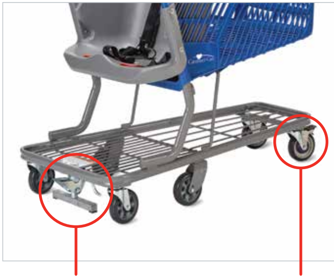
Front Wheel Brakes